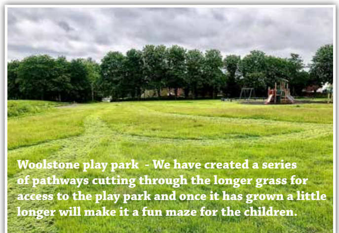
Woolstone play park - We have created a series of pathways cutting through the longer grass for access to the play park and once it has grown a little longer will make it a fun maze for the children.