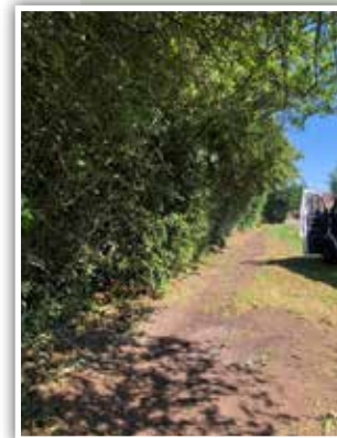
Footpath clearance at Willen

The resident was very surprised and pleased that the Landscape Team had completed the work so quickly.