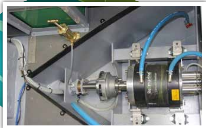
Electra community boat electric propulsion motor drive image courteous of Colecraft Engineering Ltd.

Now that the boat has been delivered, the Trust is recruiting more volunteers, both onboard and ashore. The website has further details: bmkwaterway.org/mkcommunityboatelectra .