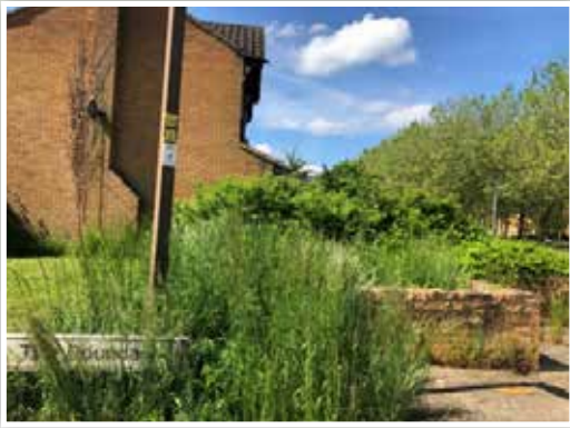
Photo showing overgrown shrubs