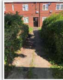
Overgrown bushes at the Sheltered housing in Oldbrook.

On the 8th June, our Landscape Supervisor emailed the resident saying she would investigate and the work was carried out on the same day.