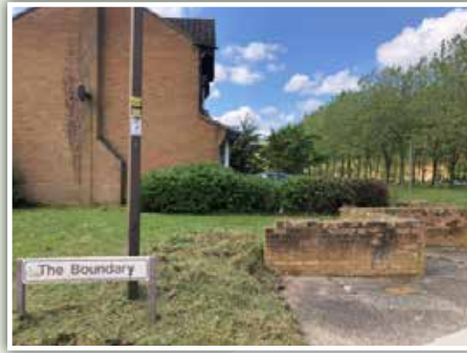
Photo after the work has been completed

During May and June we received 21 emails from residents identifying issues in their area. The majority of these have now been addressed. We must point out that not all green areas, shrubs etc are part of the contract that we have taken over. Some areas are still maintained by Milton Keynes Council and The Parks Trust. If you would like to check an area that you are concerned about, please go to our website at https://www.campbell-park.gov.uk/ and check out our Landscape page. Use the link to check if the area is part of the Campbell Park Parish Council landscaping contract, enter the postcode, select your address and then click on Find. Click on the My Maps tab and then under Map Categories (on the left of the map) tick Landscape – Maintained General