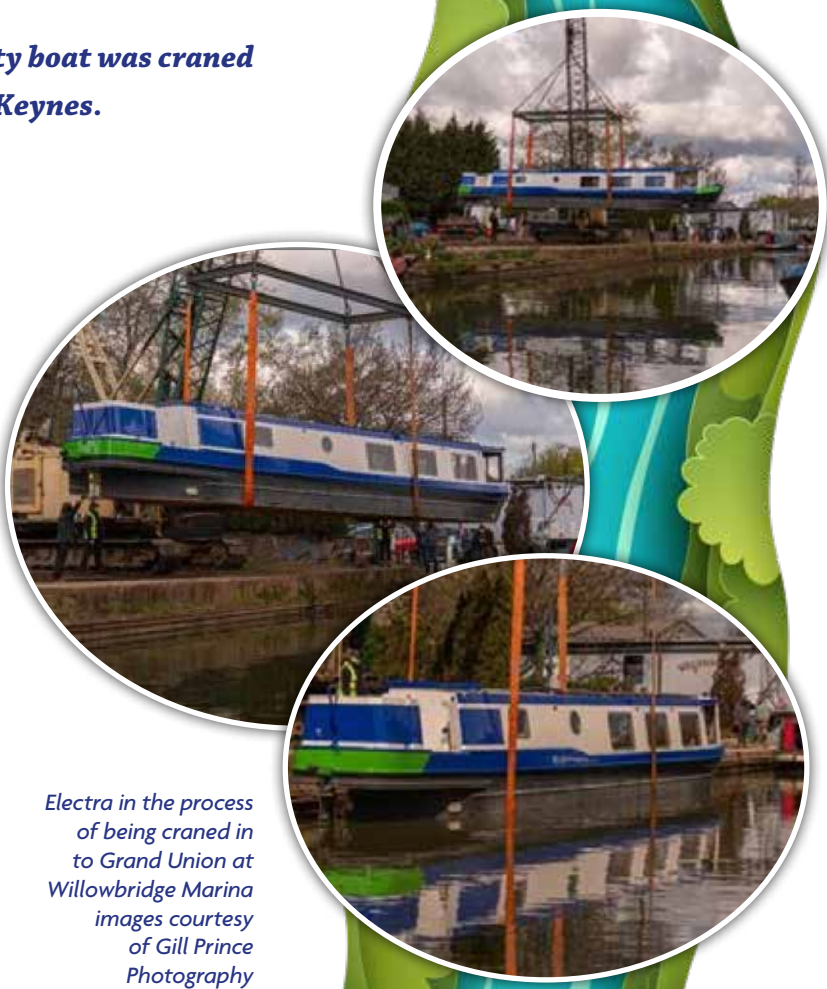
Electra in the process of being craned in to Grand Union at Willowbridge Marina

"The demand for electrically propelled boats is definitely growing. With the government's commitment to ensuring all inland waterway vessels meet zero emissions by 2050, this is definitely the right way forward," he added.