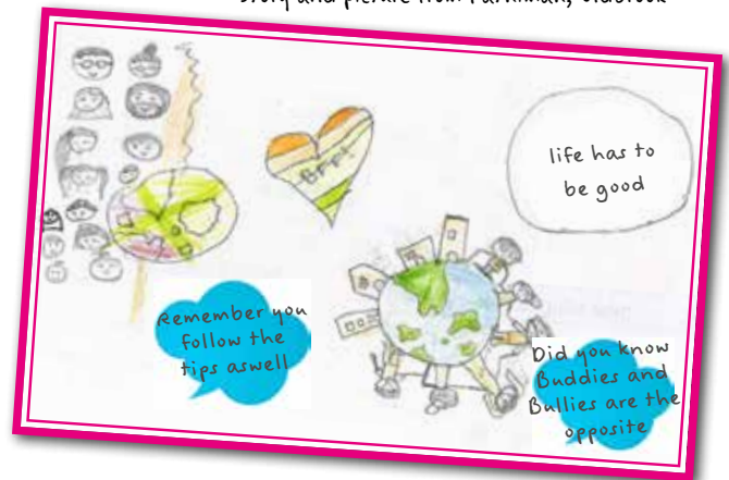
Story and picture from Fathimah, oldbrook

Welcome to this story. Today we're going to learn about "True Friends". Lets begin. We make friends to stick with forever. These are some tips which shows they are bad friends: being mean, showing off, bullying and doing bad stuff. After any of these situations happen, break up with your friends. If you get in trouble, don't worry and be good. Never talk to bullies. Just walk away from them. Only be friends with kid, loving and caring people. These special people are called buddies. The End