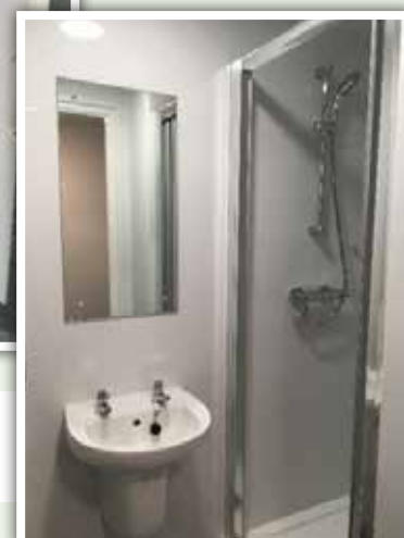
Ensuite shower room