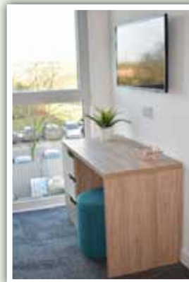
Furnished Stage 2 Room on our new campus

https://www.onthemarket.com/details/8304690/