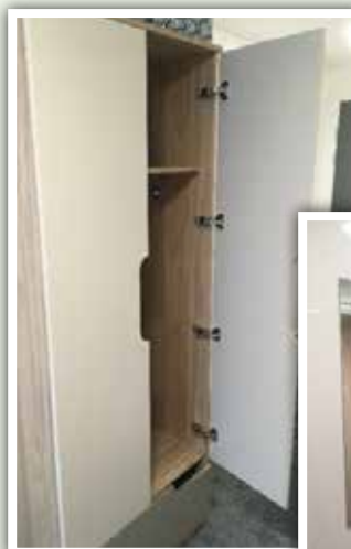
Robust wardrobe with shelf and large storage drawer