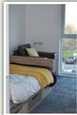
Study desk with soft close drawers and poof seat