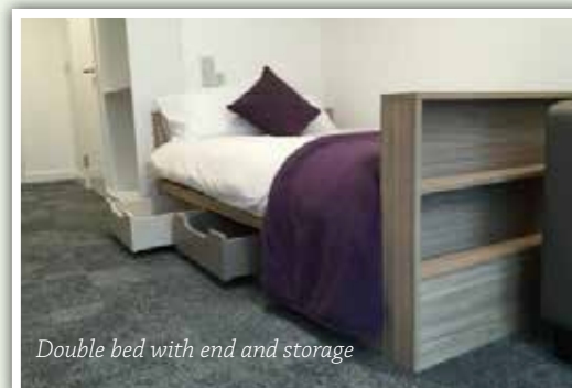
Double bed with end and storage