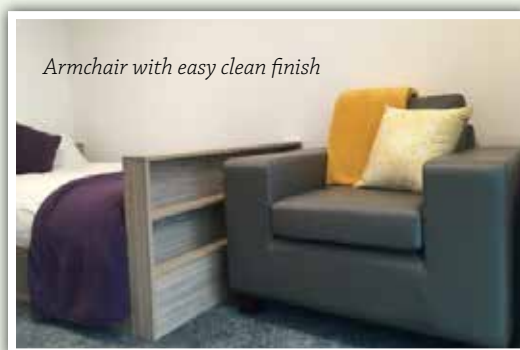
Armchair with easy clean finish