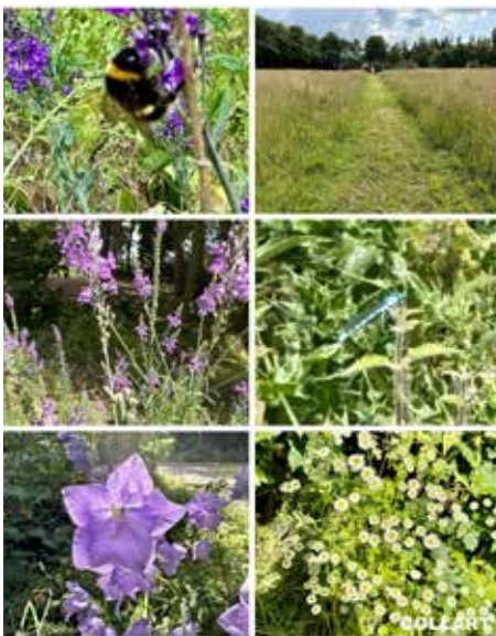
WILDLIFE SPOTTED IN OUR WILD AREAS

This year starting with Oldbrook Green and Woolstone Green we are beginning to evolve these areas to include wildflowers.