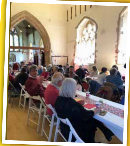
- Woolstone event -

or contact the Community Officer at the Parish office on 01908 608559